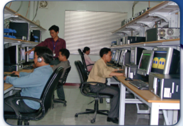
NTS staff conducts multiple diagnostic test programs to major industry standards.

NTS Vietnam provides economical test engineering hardware and software testing services including a wide range of Quality Assurance services to the computer industry. An extension of our U.S. based computer testing operations, NTS Vietnam Engineering services range from software and test automation for enterprise environments, to developing and programming test suites to validate software and firmware code. Our breadth of services is second to none. These services include programming, compatibility, functionality, interoperability testing, establishing benchmarks, performance testing, load/stress testing, usability analysis, test plan development, and system integration.