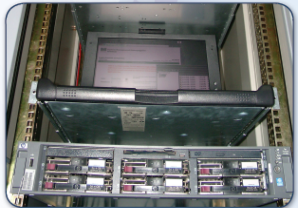
NTS Golden Suite testing includes over 200 USB devices.

NTS Vietnam can provide highly skilled and seasoned test engineers for technology companies. We provide technical management for test engineering development and testing execution and reporting in Vietnam. We maintain an extensive multimillion-dollar up-to-date hardware and software library that facilitates our ability to verify product and software compatibility, compliance and performance to international standards and user requirements including USB and WHQL certification.