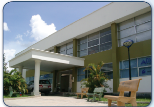
NTS Vietnam is located in Quang Trung Software Park in Ho Chi Minh City.

NTS develops test plans, test methodologies, execution test procedures, and can provide systems configuration and complete test bed setups. NTS test engineers perform customer-specified quality assurance testing projects and provide deliverables including complete test report of all test cases, anomaly report for each defect, regression report for each fix, and a final report summarizing all test results.