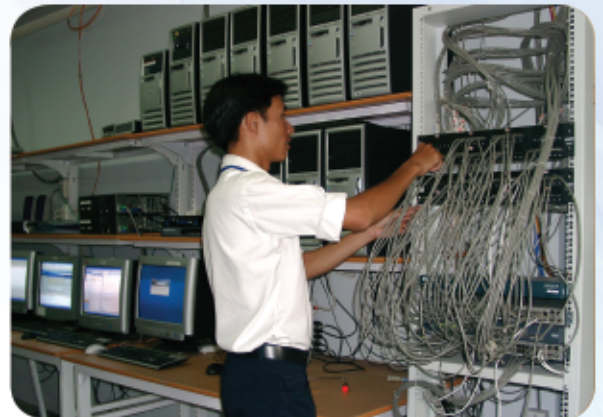
Network testing is routinely accomplished utilizing the NTS computer farm.